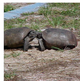
2 adults fighting