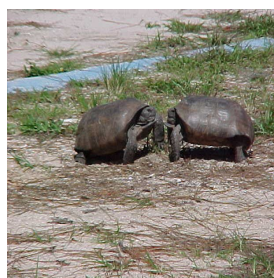
2 adults fighting

Gopher Tortoise: The gopher tortoise is a protected species and is listed as “threatened”. The gopher tortoise is important to its habitat because it creates a micro-climate that attracts over 350 different species of animals. As the gopher tortoise digs its burrow, it digs down to the water table. Often, the end chamber will connect to the water table and provide a source of clean water. Additionally, this water source creates a cool moist environment for all