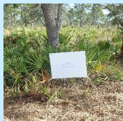
A scavenger clue

Proceeds help to support the Florida Scrub Jay and the habitat necessary for this indigenous bird to exist in Florida and at Oscar Scherer. Last year we introduced the 10K Scramble and received some great feedback on the course. This is not for your regular runners. This is trail running with ups & downs, dips & tricks. Well not really any tricks but some great scenery along the way and narrow bridges to make your way across. This year we are leaving in the Virtual option for registration. So even if you can't attend the event to run in the park you can still participate. You can register for this event on https://runsignup.com/Race/FL/Osprey/ScrubJay5K10