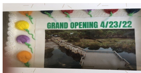
Cake served at the ribbon-cutting ceremony