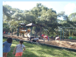
2019 Playground Project

National Public Lands Day: Sept. 24 th 9-1. Support your local public lands by giving back. We will have service projects in the park like trail work, trimming, cat tail removal and more. Lunch and music are provided for registered project participants. Give back to the environment and make a difference. Great opportunity for groups, schools, individuals and families.